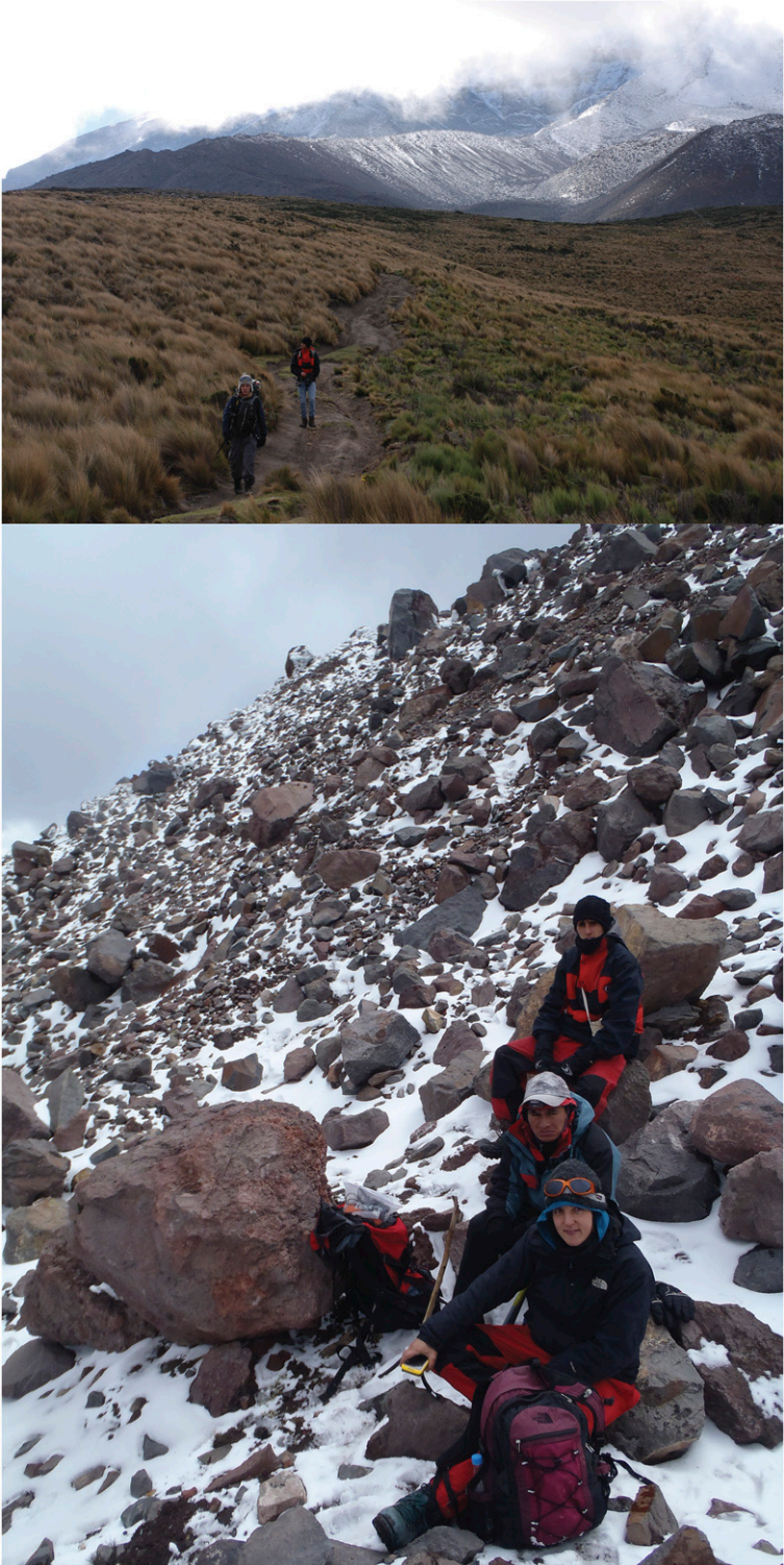
Figure 4. Resurveying the Chimborazo volcano 210 years after Humboldt from 3800 m elevation (top) to 5200 m (bottom). Despite the technical advances of the age of Big Data, fieldwork is still needed for understanding changes in plant geography driven by environmental change.