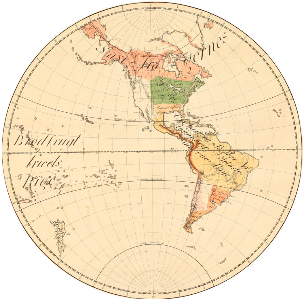
Figure 1. First atlas of the geography of plants in the New World, largely informed by Humboldt's collections. By Joakim F. Schouw (1789–1852), published in 1824 (excerpt of Panel XII in Schouw, 1824), after a draft was published in 1822. Visible Danish annotations translate into “Kingdom of the Breadfruit” over the Pacific islands, the “Saxifragas” in northern North America, and “Kingdom of Cacti, Pepper species and Melastomes” across Central and South America.

with small distributions (von Humboldt & Bonpland, [1807] 2009). The observations of Humboldt confirmed and added both detail and novel insights to the general patterns reported by preceding and contemporary naturalists (Jackson, 2009a).