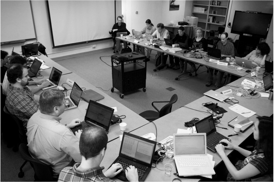
Figure 3. The Botanical Information and Ecology Network (BIEN) working group, a collaborative effort of botanists, ecologists, and computer scientists active since 2008. To assemble the largest botanical dataset on New World plants, much of the work has moved to behind computer screens. The group also illustrates the movement of the field of plant geography toward collaborative, interdisciplinary work.

identifications (e.g., Carranza-Rojas et al., 2017) will help us get closer to Humboldt's and Schimper's visions of knowing where everything, everywhere, is living.